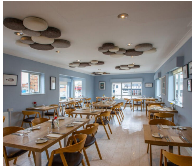
Albatross Fish & Seafood