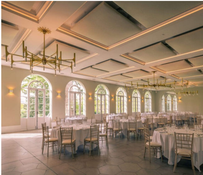
Deer Park Country House