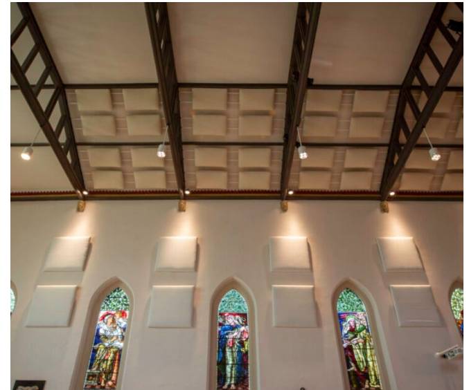
Holy Trinity Church Frome